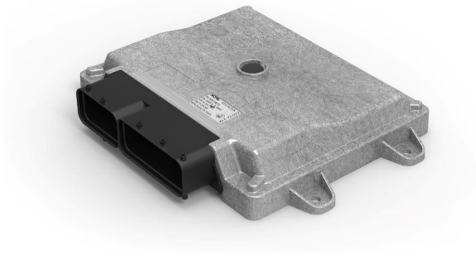
Actua by MTA, an Actuator Control Module for Lovol Arbos

MTA S.p.A. is a global leader in the development and production of a wide range of electromechanical and electronic products developed internally for the primary manufacturers of cars, motorcycles, tractors, and heavy vehicles. Founded in 1954, MTA has two production sites in Italy (Codogno and Rolo), 8 foreign sites, sales of about €180 million, and 1,200 employees.